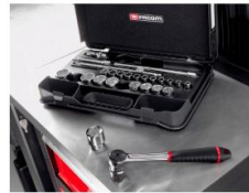
RATCHETS & SOCKETS